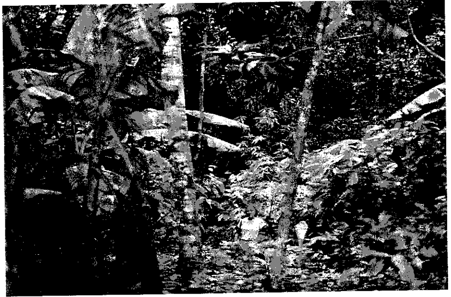
Figure 1.2 Highly diverse agroforestry systems, such as the Dammar system from Indonesia, can be found in many tropical regions. This photograph shows a similar agroforestry system from southeastern Mexico. It is known locally as a “huerto,” or tree-garden. These traditional agroforestry systems of mixed, cultivated perennials may be structurally similar to old, second-growth natural forests and contain nearly as many tree species on a per-hectare basis.

(see Carroll 1990 for examples), and some shifting cultivators practiced a kind of management of natural succession. Today, in “Dammar” agroforestry in Sumatra, for example, natural forest plots are converted over a period of 10–20 years into complex modified forests based primarily on dammar ( Shorea javanica ), a tree that is tapped for resins, and other economically important native trees (Mary and Michon 1987). The plots are structurally similar to natural successional plots and probably help support regional biodiversity. Although we may think of conservation management as a modern Western notion, there are many such examples of management of natural resources to be found in other cultures (Figure 1.2).