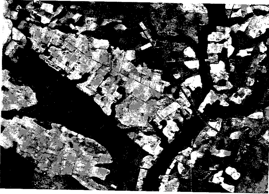
Figure 1.4 An example of a mixed natural and human landscape in South Carolina. This aerial photograph shows patches of natural areas of various sizes interspersed with human-dominated activities such as agriculture and housing.

By the 1960s and 1970s, it was becoming painfully obvious to many ecologists that prime ecosystems throughout the world, including their favorite study sites, were disappearing rapidly. Biodiversity, the outcome of millions of years of the evolutionary process, was being carelessly discarded, and, in some cases, willfully destroyed. Previous conservation efforts, while focusing on important components of nature such as large vertebrates, soils, or water, still had not embraced the intricacies of complex ecosystem function and the importance of all the “minor,” less charismatic, biotic components such as insects, nematodes, fungi, and bacteria. It was time to change this attitude.