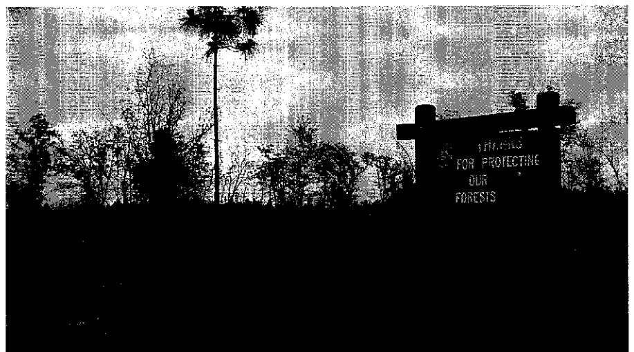
Figure 1.3 The deeply rooted multiple-use paradigm of the U.S. Forest Service is reflected in the irony of this sign in Aiken County, South Carolina, and the virtually clear-cut forest in the background. The Resource Conservation Ethic that has dominated most public resource agencies demands that forests and other natural areas be treated as economic resources to be managed for human gain. True “protection” for biodiversity often is not an option.

The time is ripe to replace both the extreme preservationist and the exploitative utilitarian philosophies of the 19th century with a balanced approach that looks to an ethic of stewardship for philosophical guidance, and to a melding of natural and social sciences for theory and practice. This new context is necessary for conservation biology to flourish and make contributions to a sustainable biosphere.