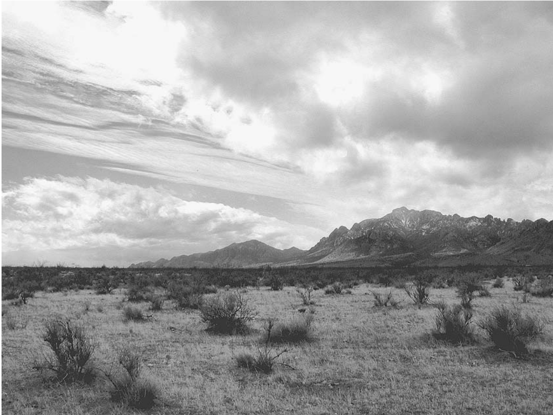
PLATE 1. The San Simon Valley, Arizona, USA, where the study was conducted, showing extensive annual plant habitat, with scattered shrubs and the Chiricahua Mountains in the distance.

partitioning. The effects of environment–competition covariance are also somewhat independent of neighborhood-scale interactions: although resource partitioning can promote coexistence in the absence of environmental variation, environment–competition covariance, through the spatial storage effect, can promote coexistence when the relative intensity of intraspecific and interspecific neighborhood competition predicts competitive exclusion, as shown here.