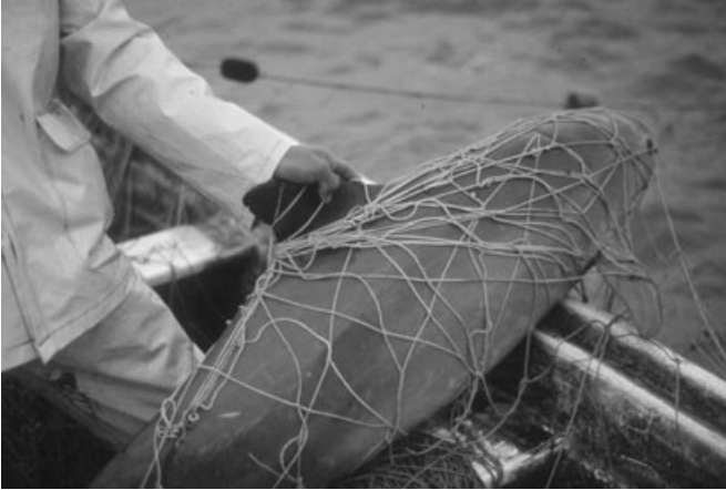
Fig. 5. A sexually and physically mature female vaquita (148.2 cm, 44 kg) killed in a gill net set illegally for totoaba near El Golfo de Santa Clara, 2 February 2002. Photo by Christian Faesi; copyright Omar Vidal. Used with permission.