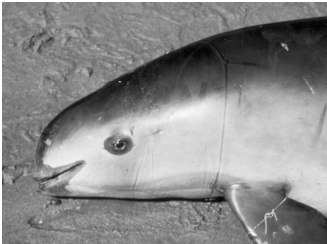
Fig. 1. A vaquita showing the head and anterior pigmentation pattern. Note the dark grey dorsal cape and the pale grey lateral field. The most conspicuous features are the relatively large black eye and lip patches. This animal died in an experimental totoaba fishery and was landed in El Golfo de Santa Clara, March 1985.

Only four living species comprise the genus Phocoena , two in the Northern Hemisphere (the vaquita and the harbour porpoise P. phocoena ) and two in the Southern Hemisphere (the spectacled porpoise P. dioptrica and Burmeister's porpoise P. spinipinnis ). All are small in body size and coastal in distribution (although there is some evidence to suggest that the spectacled porpoise has a partly offshore distribution; Brownell & Clapham, 1999a). Another common feature of the four species is that they are highly vulnerable to incidental mortality in gillnet fisheries (Jefferson & Curry, 1994). There is no reason to suppose that the vaquita is any more, or less, susceptible to accidental entanglement in gill nets than any other