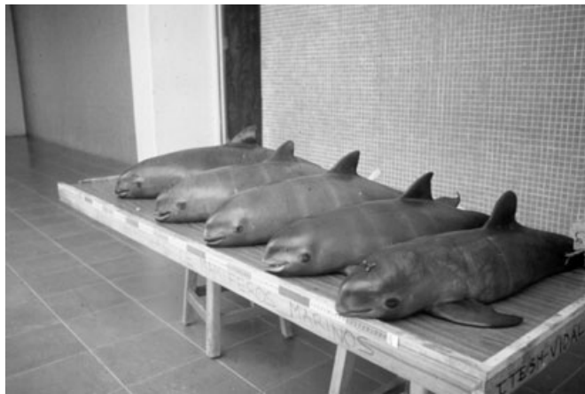
Fig. 4. Five vaquita calves awaiting necropsy at the ITESM-Guaymas laboratory. The calves were killed in gill nets set for totoaba, near El Golfo de Santa Clara, March–April 1991.